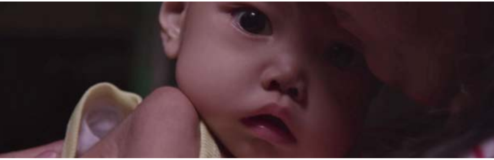
TAG LINE: Born into this world